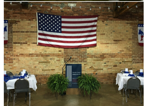
DEMOCRATIC, Functional, Beautiful and Patriotic on the inside

[many meetings, speakers, heavy use by candidates]